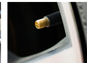
Tire Pressure Monitoring Sensors