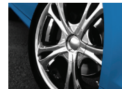
Aftermarket Wheels with No Surcharges