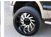
Includes Oversized Tires and Wheels