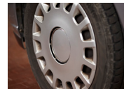
Cosmetic Damage to Hubcaps