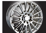
Cosmetic Damage to Chrome/Chrome Clad