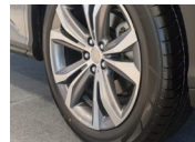
Cosmetic Damage Wheel Replacement